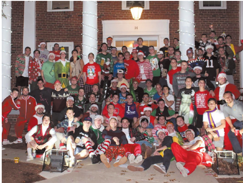
Hoping your Holidays are Merry and Bright from 14 Fraternity Row!

How was this fall's rush affected by COVID-19?