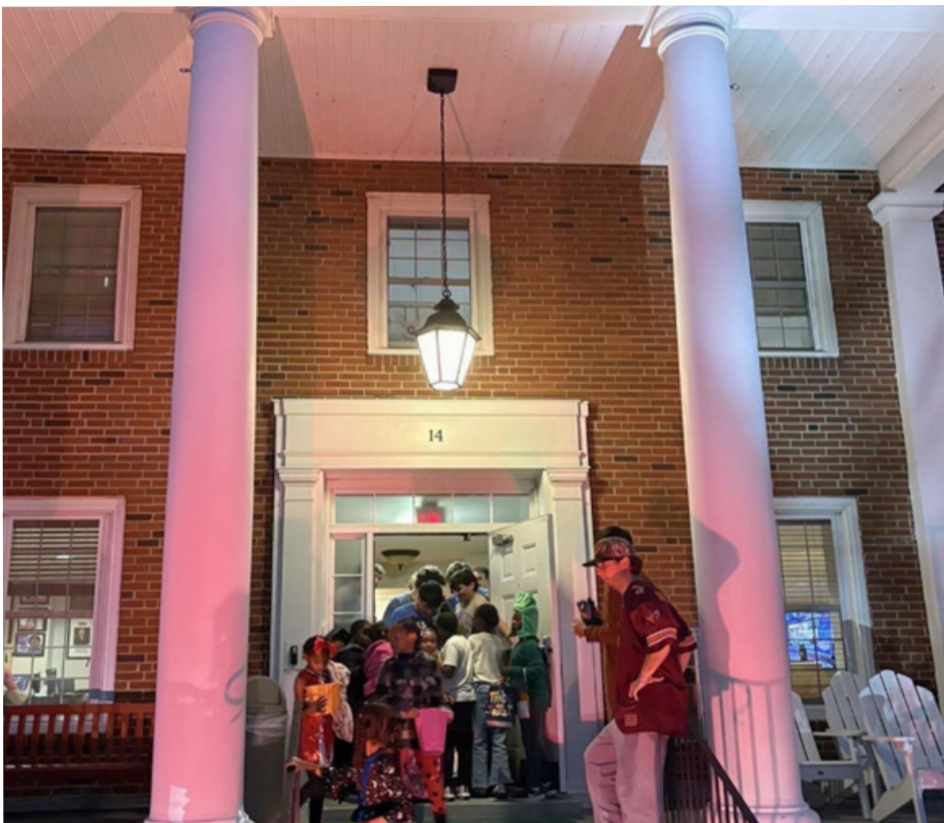
Sigma Chi greets eager trick-or-treaters as they participate in the Greek Life Service event.