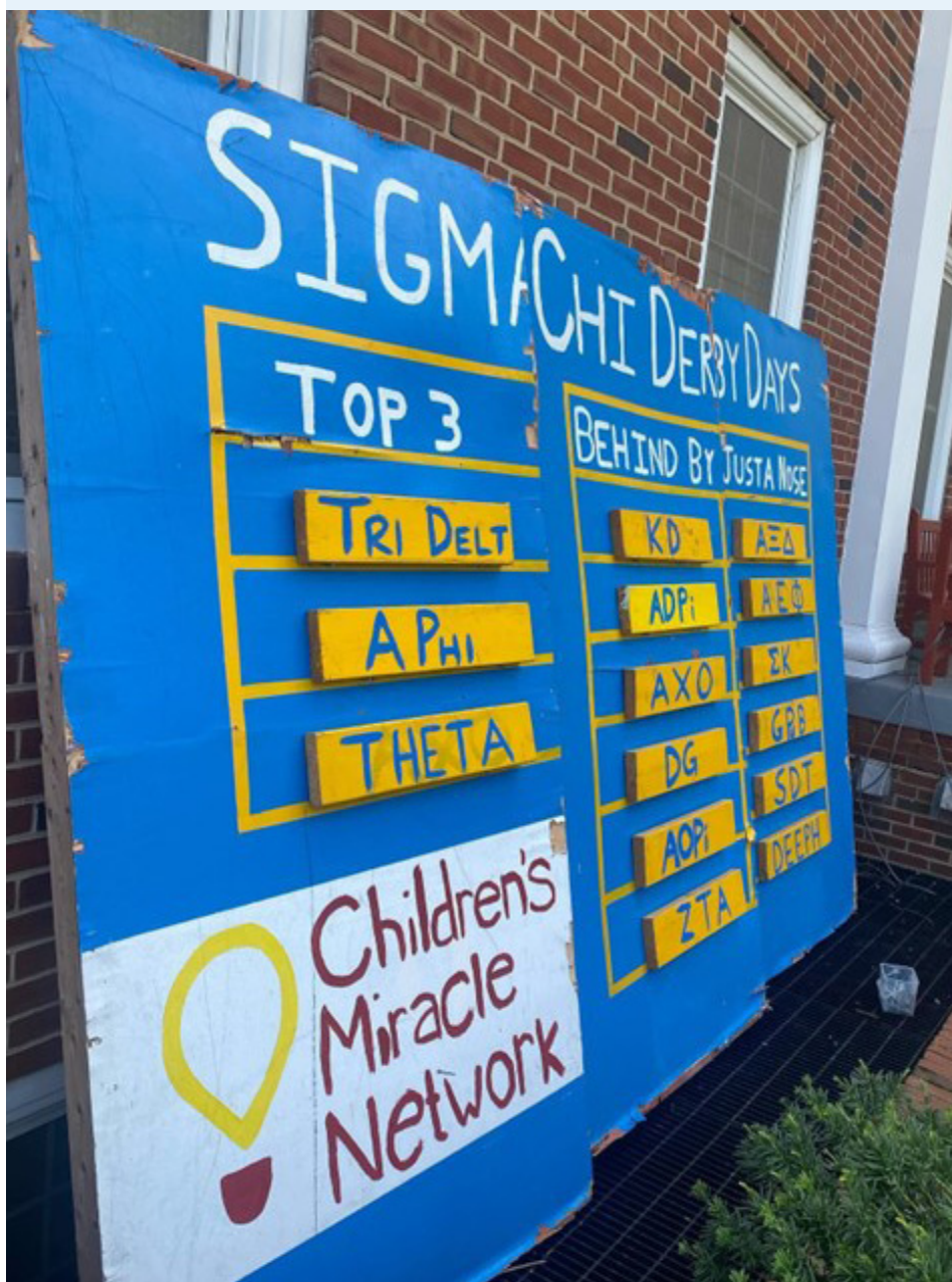
The Derby Days leaderboard tracks the fierce competition between the participating organizations.