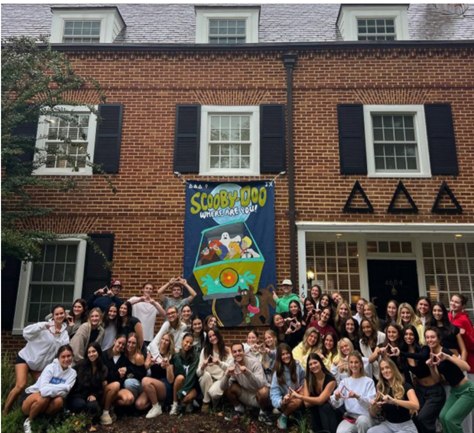
The overall winners of Derby Days 2024, the sisters of Tri Delta, pose underneath their banner.