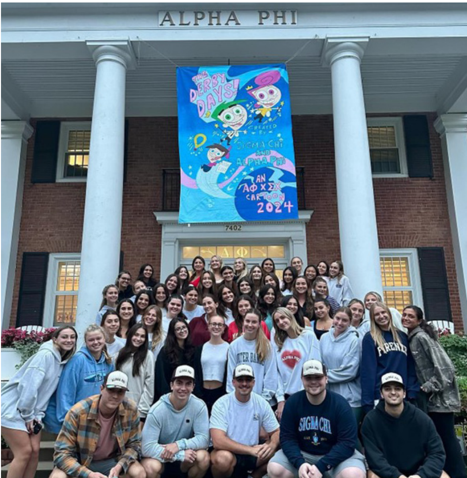
Alpha Phi proudly shows off their first-place banner for the Derby Days 2024 banner competition.