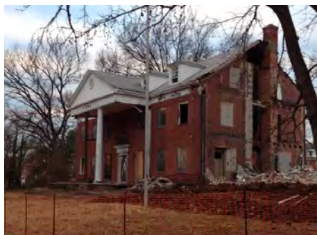
On January 14, 2015, the demolition began on the original chapter house.

In spring 2008, the chapter successfully recolonized and was granted a charter again by Sigma Chi on September 27, 2009. Given the estimated multiple million-dollar cost of renovating the Norwich Road property and bringing it up to current building codes, the chapter Alumni decided to pursue an on-campus fraternity house. The chapter moved into #14 Fraternity Row in August 2010: one of the chapter houses designed by Sigma Chi's Hugh Jacobsen.