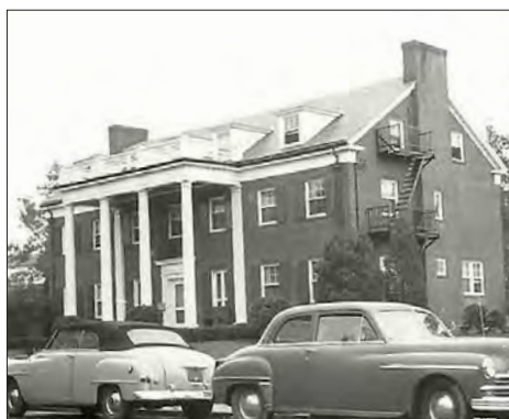
Gamma Chi chapter house in 1954.

Have you brushed up on your Gamma Chi history lately? Believe it or not, this is what the original chapter house looked like in 1954, before the expansion in 1966.