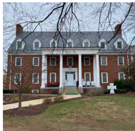
Gamma Chi chapter house today.