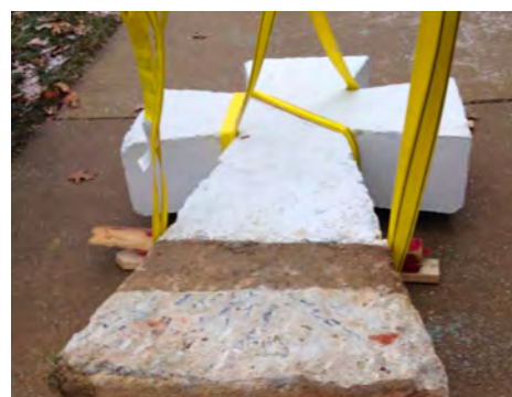
Part of the White Cross transport process from the original chapter house to our current house on demolition day in January 2015.

The Norwich Road property was sold to the university in 2015, and the old house was razed as a part of the sale. In January 2015, the old house was demolished, and the White Cross was moved from 4600 Norwich Road to the front of the current chapter house, where it stands today.